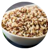
Quinoa 8 grams of protein per cup (cooked).