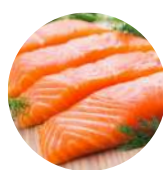
Fish (Salmon etc) 18 grams of protein per 85 grams