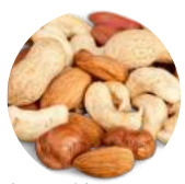
Nuts (Assorted) Average 5g p/25 g serving