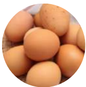
Free range eggs 6g p/egg

According to the protein leverage hypothesis theory, when the body's protein needs are not met, individuals will continue eating until they achieve the required amount of protein, often leading to overconsumption of total calories. Dr Lara Briden, ND writes that the solution to evening binging, snacking and regulating blood sugar levels is to eat high-protein food by 12AM, preferably 10AM. Women can aim for average of 60 g per/ day. Example of protein options: