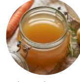
Bone broth & collagen 10g p/serving (or cup of bone broth)