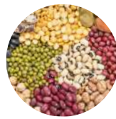
Beans 15 grams of protein per cooked cup