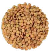
Lentils 18 grams of protein per cooked cup